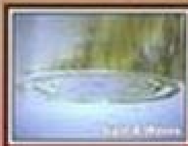
Light & Waves