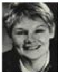
DAME JUDI DENCH