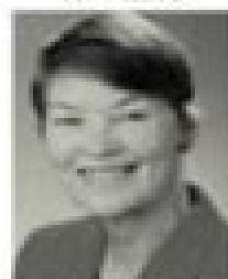
DAME GLENDA JACKSON