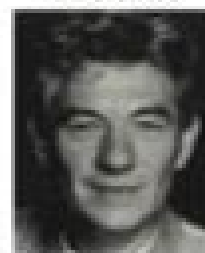
SIR IAN MCKELLEN