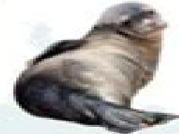
Hawaiian Monk Seal