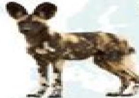
African Wild Dog