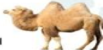
Wild Bactrian Camel