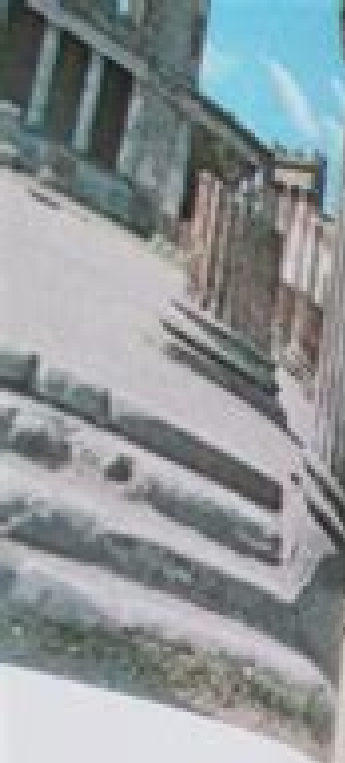
Bottom: View of the main forum "Tribunal" colonnade in its heyday. The white lines of the colonnade which surrounded the forum