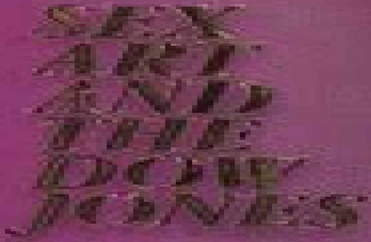
Figure 10.10 – Christmas tree, Thuja occidentalis .