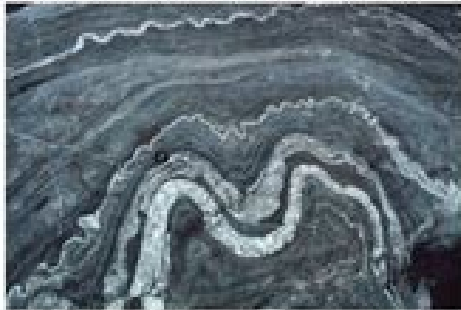
Folds, Boudinage, Reaction rims, Fractures