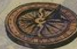
Pocket compass and sun dial.