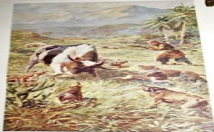
GRINDING WILD CATS IN THE