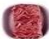
10% (Fat) BEEF MINCE