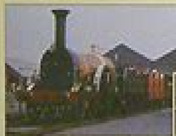
The first steam locomotive, built by Trevithick in 1804, was the first to be built in Britain.

Brunei, a contemporary of Robert Stephenson, was the first to build a steam locomotive. He was the first to build a steam locomotive. He was the first to build a steam locomotive. He was the first to build a steam locomotive.