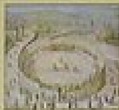
The first steam locomotive, built by Trevithick in 1804, was the first to be built in Britain.