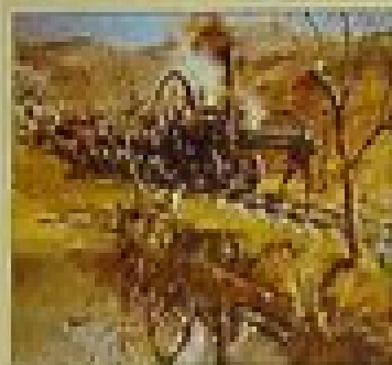
The first steam locomotive, built by Trevithick in 1804, was the first to be built in Britain.

Trevithick, a Cornishman, was the first to build a steam locomotive. On 19 February 1804 his Cornishmen designed and constructed a portable engine for the Duke of Devonshire. Trevithick's portable engine was the first to be built in Britain. It was a portable engine, but it was also a steam locomotive. It was the first to be built in Britain. It was the first to be built in Britain.