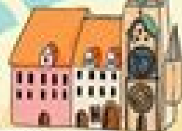
STARÉ MĚSTO OD TUNEL