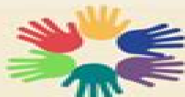
START A GOOD COURSE