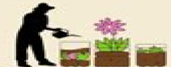
PICK A NEW HOBBY