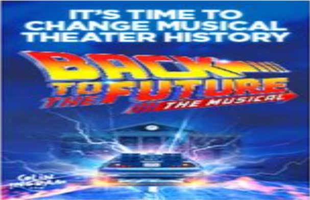
Plays on Broadway