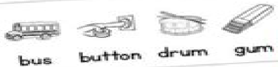
bus button drum gum

Say the name of the object out loud. Find the word. Look across for the word. Circle the word.