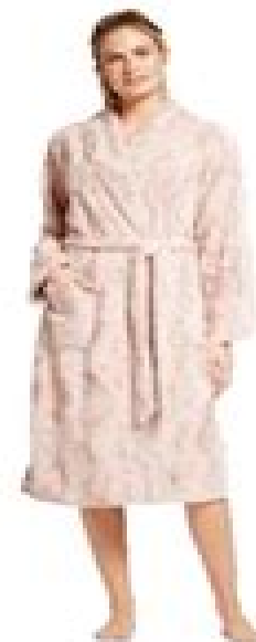
16. BEST DARN ROBE EVER... ALSO COMES IN GREY