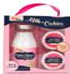
12. PERFECT BATH GIFT