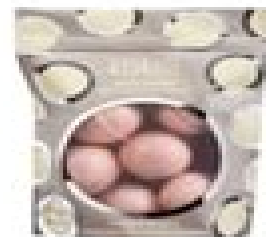
5. BATH BOMBS