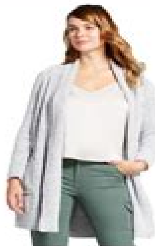
13. THIS CARDIGAN IS LIFE