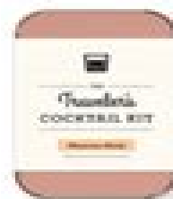
14. CARRY ON COCKTAIL!