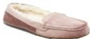
6. ADORABLE BLUSH SLIPPERS