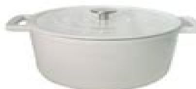
10. CAST IRON CUTIE