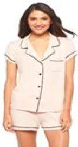
9. CUTEST PJ SET UNDER $20