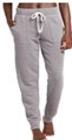
11. CUTEST JOGGERS