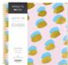
8. HAVE THIS PLANNER & LOVE IT