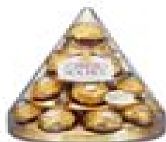
7. UMMM YES