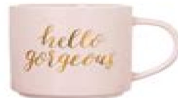
15. LOVE THIS MUG!