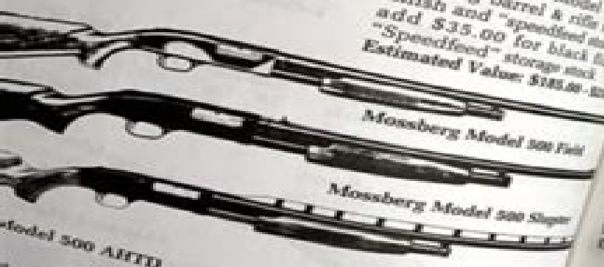
Mossberg Model 500 Field

Mossberg Model 3000 Field Gauge: 12 or 20; regular or magnum Action: Slide action; hammerless; repeating Magazine: 4-shot tubular, 3-shot in barrel; 26" improved cylinder, 28" modified or full, 30" full; ventilated rib; "Multi-choke" optional; add 10% for "Multi-choke" Finish: Checkered walnut pistol grip & slide handle Estimated Value: $200.00 - $265.00