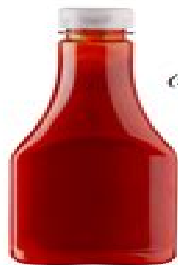
HIGH FRUCTOSE CORN SYRUP (soda, sweetened beverages, candy, ice cream, sauces, etc)