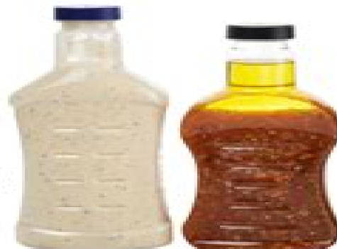
PROCESSED SEED OILS (canola, corn, soy, vegetable, etc)