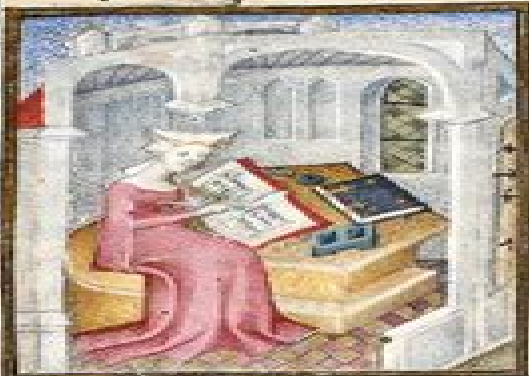
Le premier chapitre pue de la desaipeon du corps de poliee

EDITED AND TRANSLATED BY Angus J. Kennedy