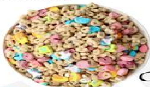
FOOD COLORING (Red 3, Red 40, Yellow 5, Yellow 6, Blue 1, etc)