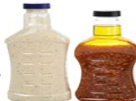
PROCESSED SEED OILS (canola, corn, soy, vegetable, etc)