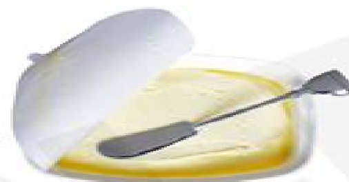
HYDROGENATED OILS (aka trans fat)