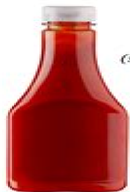
HIGH FRUCTOSE CORN SYRUP (soda, sweetened beverages, candy, ice cream, sauces, etc)