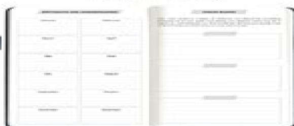
Birthdays and Anniversaries & Vision Board