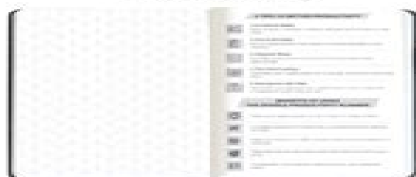
5 Tips to better Productivity