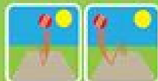
Out Swing In Swing

The bowler will put spin on the ball when bowling. When the ball arrives on the ground it will rotate in direction. Spin bowlers are usually a lot slower than swing bowlers.