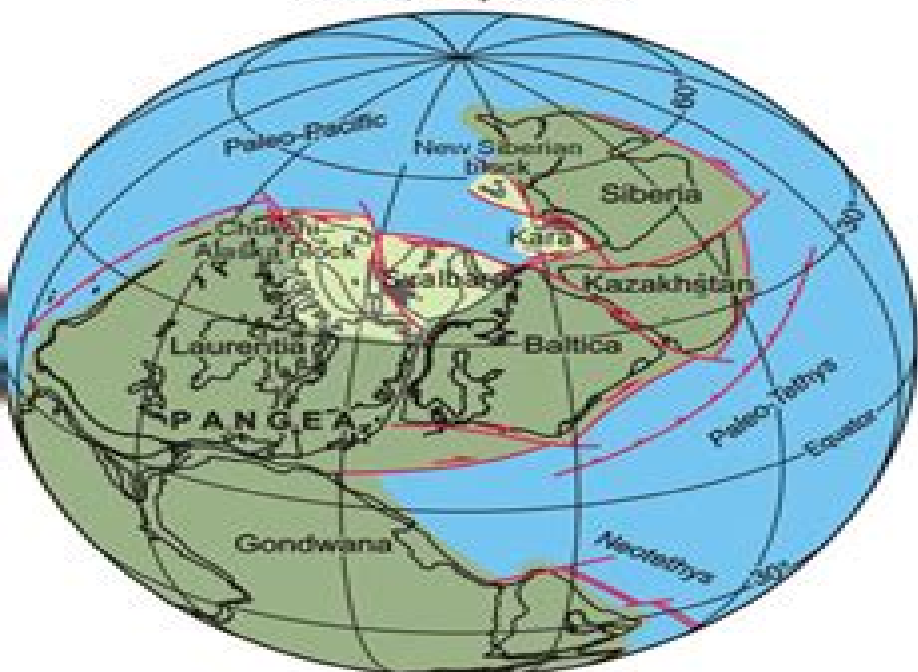
280 Ma, Early Permian