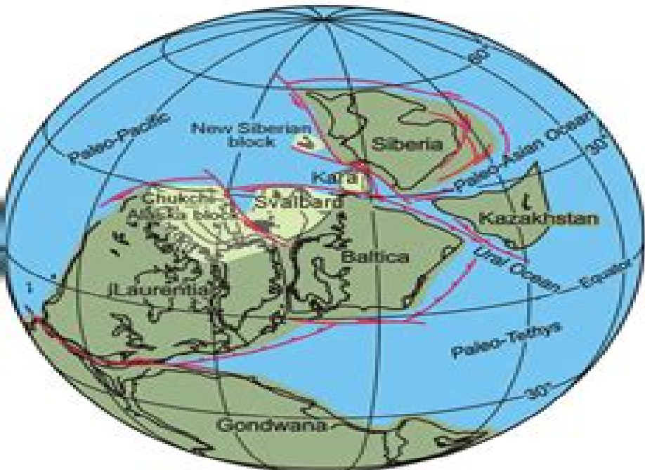
330 Ma, Early Carboniferous