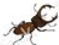
EUROPEAN STAG BEETLE