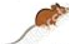
STRIPED FIELD MOUSE