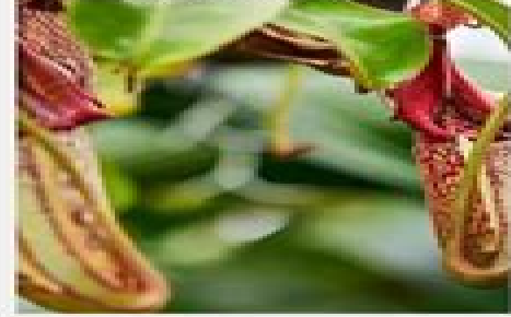
Pitcher Plants (Nepenthes)