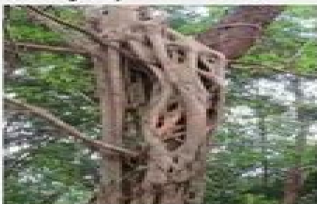
Strangler Figs (Ficus nymphaeifolia)