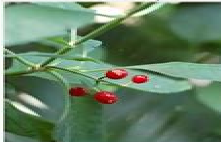
Coffee Plant (Coffea arabica)