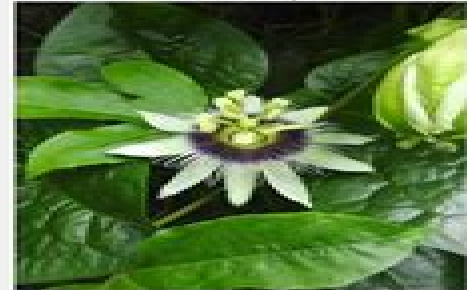
Passion Flower (Passiflora edulis)