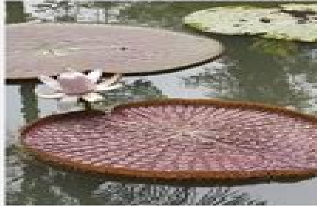
Giant Water Lilies (Victoria amazonica)