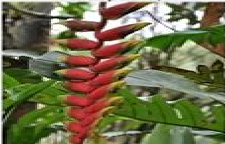
Heliconia (Heliconia latispatha)