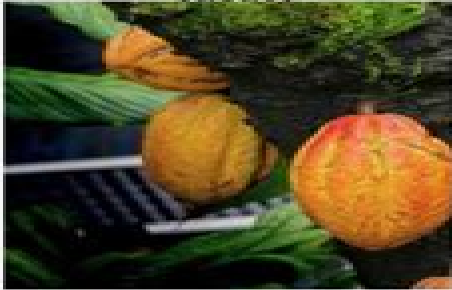
Cacao (Theobroma cacao)