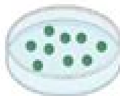
Explant in agar plate