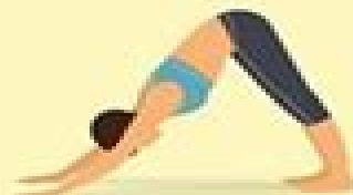
Downward facing dog