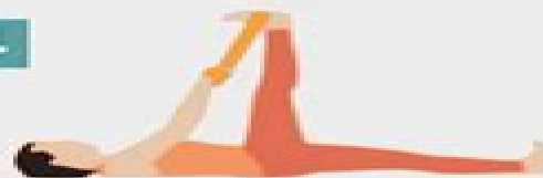
RECLINING HAND TO BIG TOE