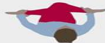
RECLINING COW FACE