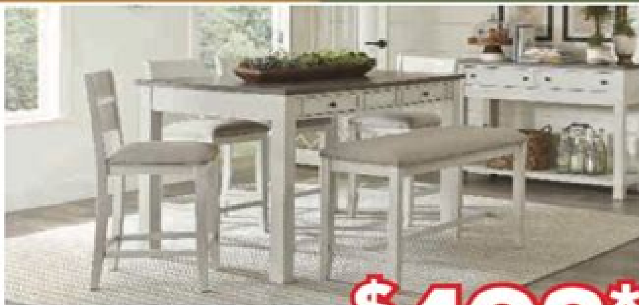
TABLE & 4 STOOLS + FREE BENCH WHILE SUPPLIES LAST