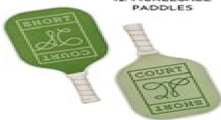
12. PICKLEBALL PADDLES