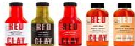
5. HOT SAUCE SET