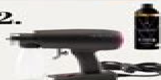
SPRAY TAN MACHINE