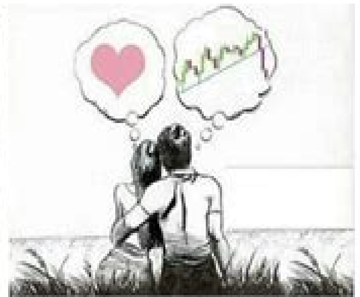
HOW MOST PEOPLE VIEW THE STOCK MARKET