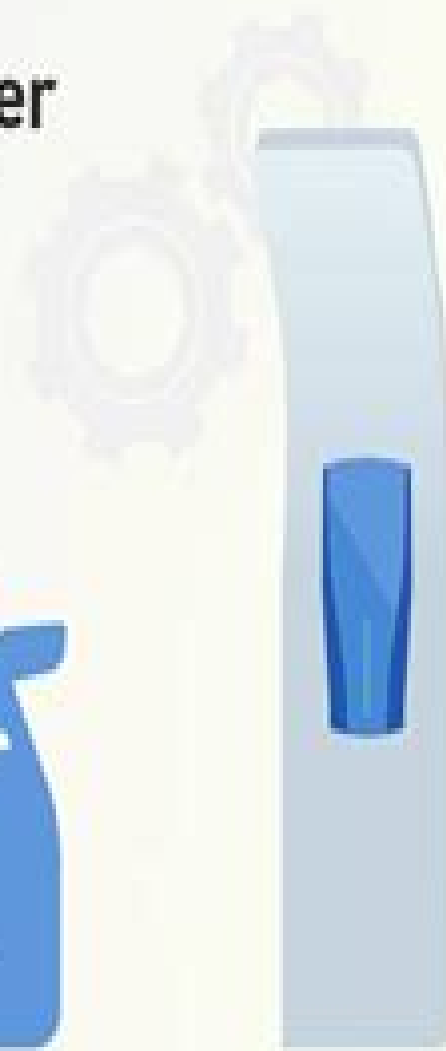
AC EV Charger