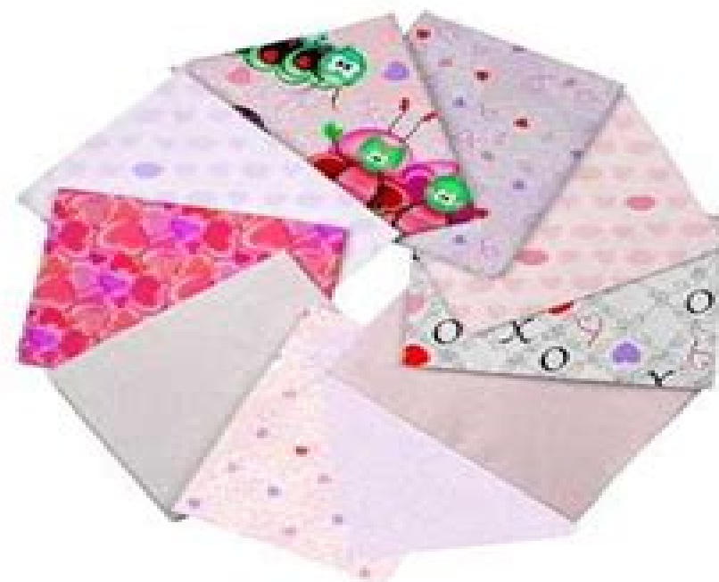
Love Bugs by Embellish Express