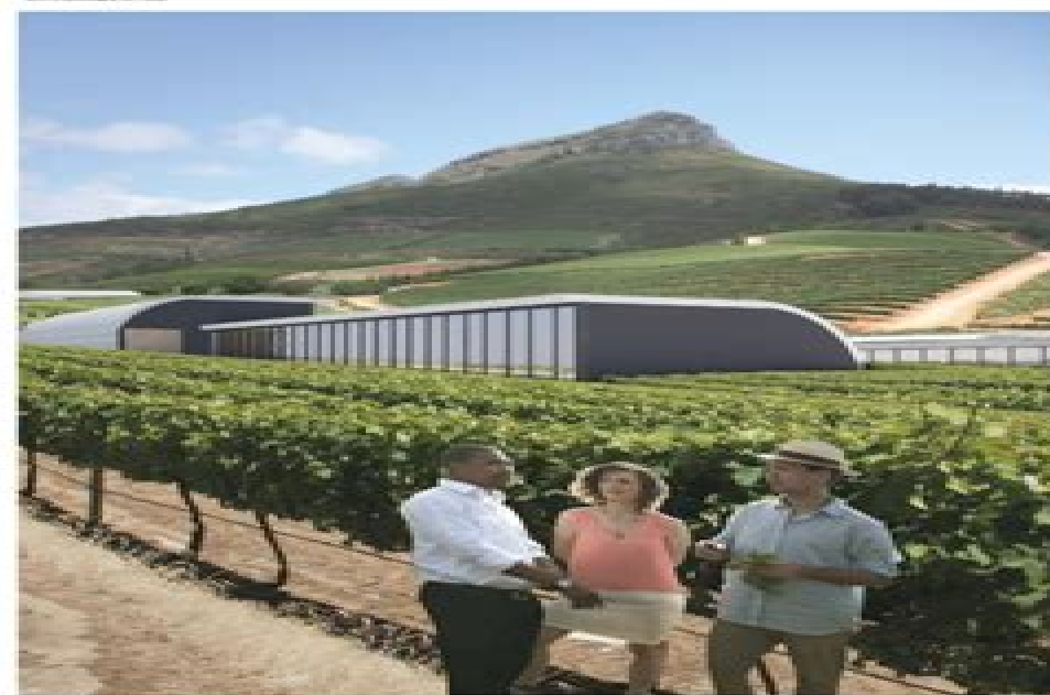
Photograph of the building exterior