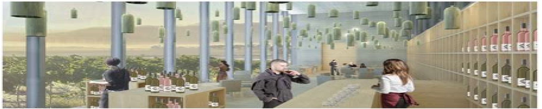
3D rendering of interior of the building