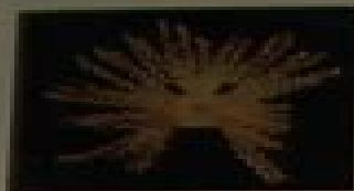
Golden Sunburst, 1960, by J. M. W. Turner