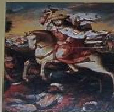
Figure 2, 1960, by J. M. W. Turner