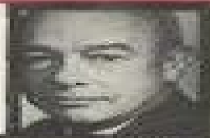
Clarence Irving Lewis