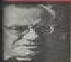
Carl Gustav Hempel

A Sourcebook from Pragmatism to Philosophical Analysis