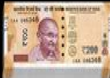
Income of the Consumer