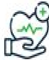
Health care systems