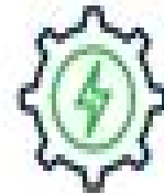
Energy management systems