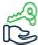
Access & security controls