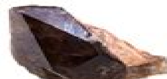
morion (smoky quartz)