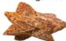
glendonite (ikaite calcite)