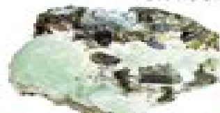
prehnite with epidote