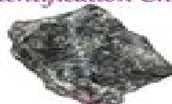
aegirine with eudialyte