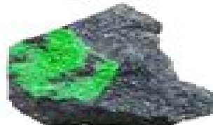
uvarovite on rock