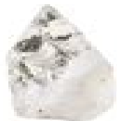
rock-crystal (clear quartz)