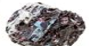
kyanite, biotite, tourmaline on gneiss