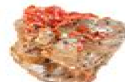
vanadinite on rock