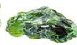
chrome diopside (green diopside)