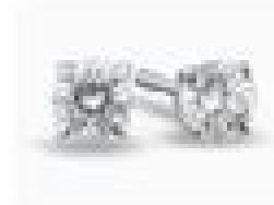
1.6CT White Diamond Stud Earrings in 14k... More