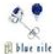
Gemstone Stud Earrings Diamond Earrings... More