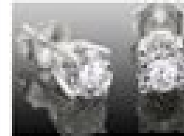
Diamond Earrings - Studs: 1 1/2 Carat, VS2... More