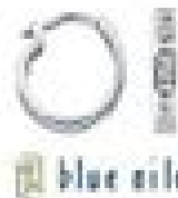
Diamond Earrings: Channel Set Hoop Diamond... More