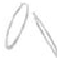
14k White Gold Large Diamond Hoop Earrings... More