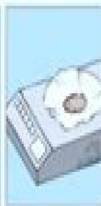
(e) Repeated drying and weighing until a constant mass of precipitate is obtained