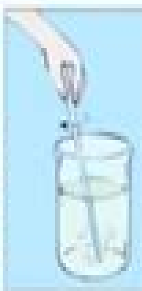
(b) Dissolving the sample in water