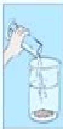
(c) Adding a suitable chemical to form a precipitate