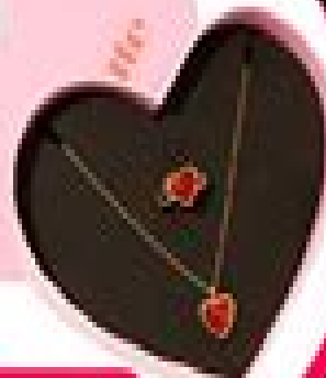
En Route Jewelry