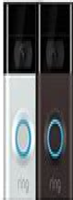
Ring Video Doorbell 2