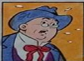
MR. WEATHERBEE - THE MAYOR OF BELEAGUERED DRY GULCH /