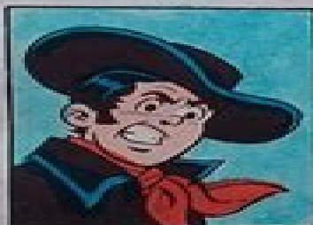
REGGIE - THE RINGOE KID / A DROPOUT TURNED DESPERADO /

FEATURING THE MIGHTY ARCHIE ART PLAYERS!