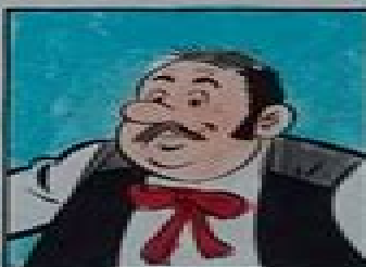
POP - PROPRIETOR OF THE DANCE HALL / THE ACTION PLACE IN TOWN /