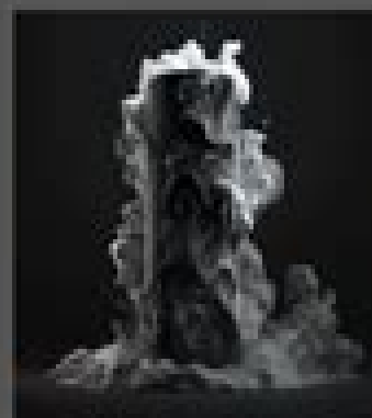
sugar and sulfuric acid