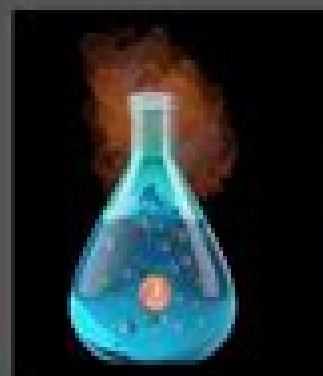
copper and nitric acid