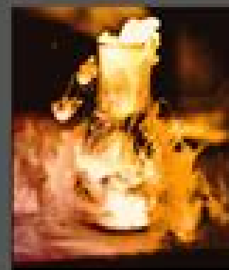
sodium in water