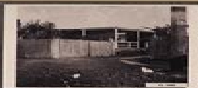
Original Building of the Taranaki Electric Telegraph Office The original building of the Taranaki Electric Telegraph Office, built in 1864, was a long, single-story building with a covered porch. It was located on the corner of the main street and the railway line. The building was destroyed by fire in 1914 and was replaced by the present building.