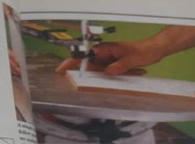
For the purposes of this study, the data were collected from the following sources:

Position and clamp the resawing jig to your handsaw table so that you can guide the workpiece along the pointed edge of the jig. Be careful to align the jig parallel with the blade and workpiece. To safely resaw the sign stock, push it through the blade until you come to within about 3" of the end of the workpiece. Then, pull both resawn pieces (called the pattern piece and