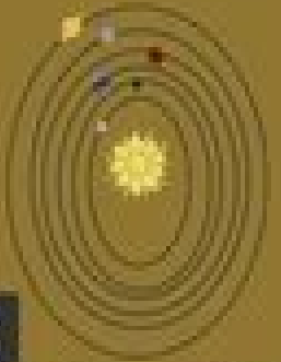
Theory of Heliocentrism