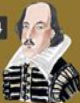
Birth of Shakespeare