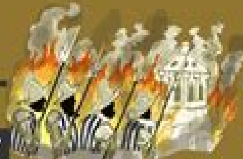
Sack of Rome