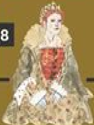
Queen Elizabeth I