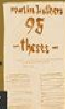
Martin Luther's "95 Theses"