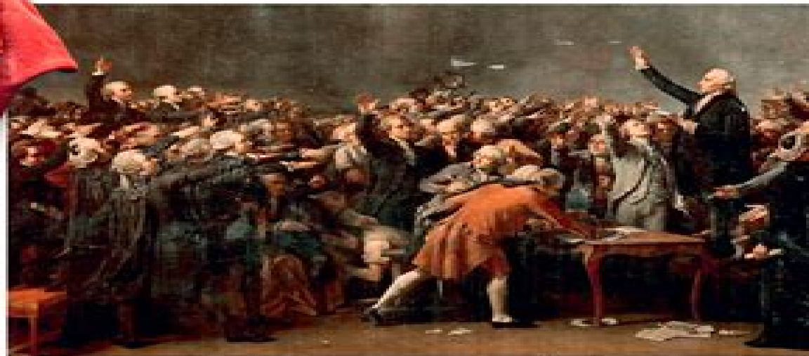
△ The Tennis Court Oath, Auguste Couder

When a mob stormed the Bastille prison (a symbol of the king's tyranny) on 14 July, the government was forced to agree to the abolition of the aristocracy. The day marked the end of the Ancien Régime, France's centuries-old political and social system.