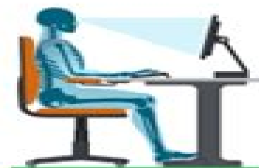
✅ CORRECT SITTING POSTURE